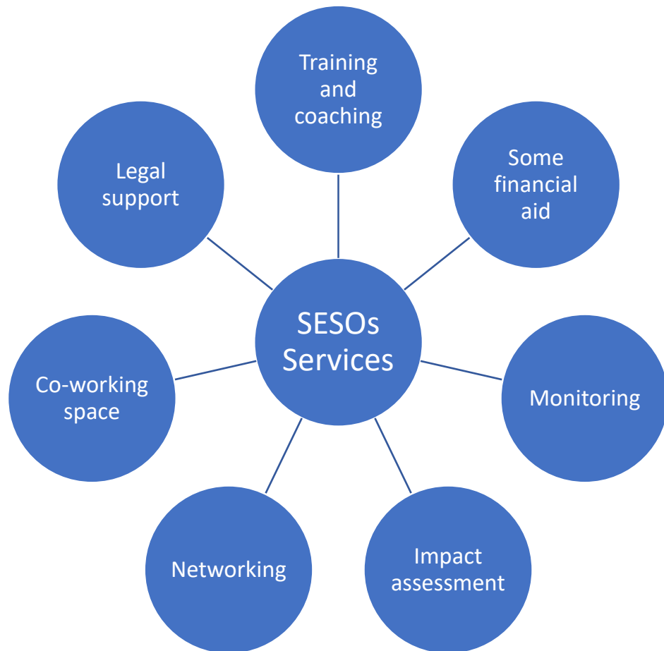
Figure 1. SESOs services that were suggested during the FGD II.