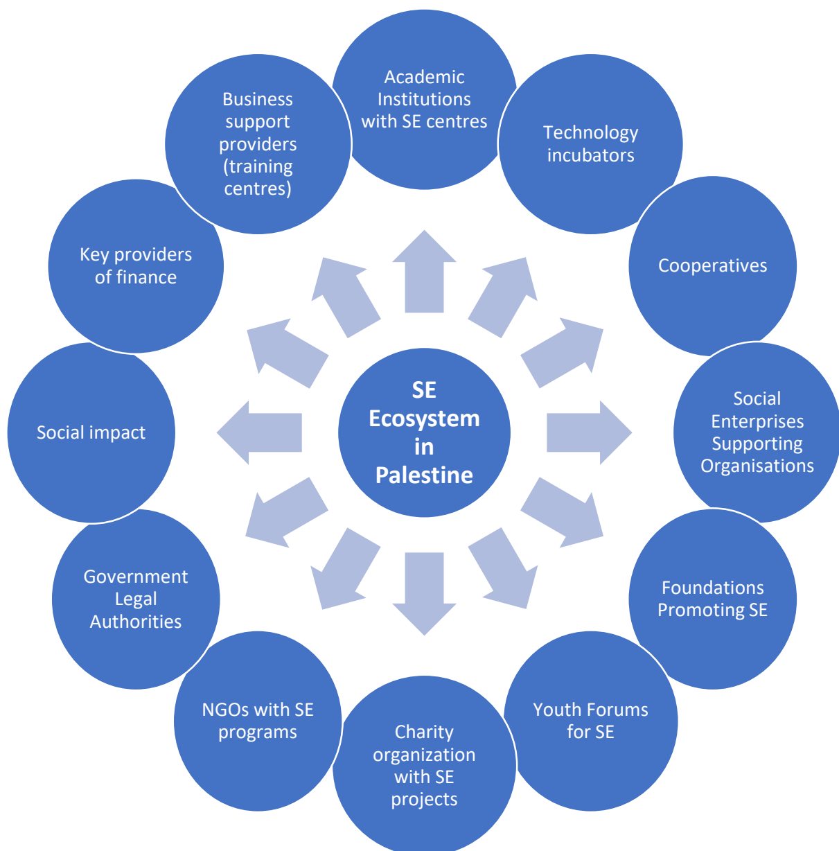
Figure 3. Social entrepreneurship ecosystem in Palestine.

The role of SEs in societies, economics, and politics depends on the economic characteristics and conditions in the individual countries and on the legal, political, social cultural, technological, and ecological framework (Volkman et al., 2012). Figure 3 illustrates the social entrepreneurship ecosystem in Palestine. Understanding this ecosystem will help us planning for the empowerment of SEs and SESOs.